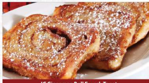
JC Cinnamon Roll French Toast

Ham, cheddar cheese, green peppers and onions. Served with hash browns and your choice of toast or biscuit with gravy.