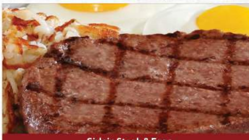
Sirloin Steak & Eggs

Add seasonal fruit topping for an additional charge