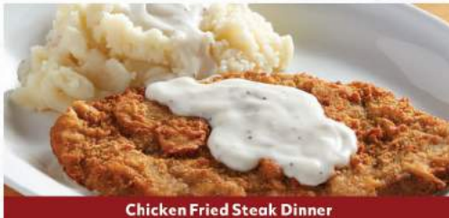
Chicken Fried Steak Dinner

Dinner is available 11 a.m. to close. All dinners are served with a bread offering.